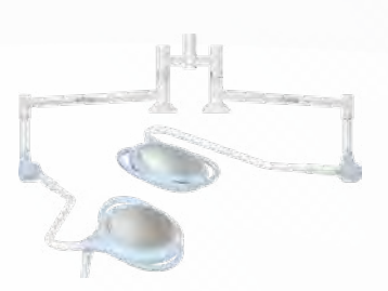
PENTA12+12 | PENTA28+28