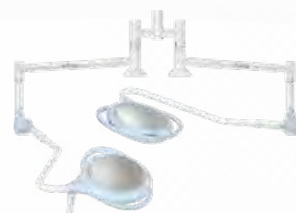
PENTA12+12 | PENTA28+28