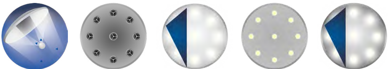
The result of a light emitting surface when an obstacle is present: indirect lighting technology on the left juxtaposed to indirect lighting technology on the right.

The introduction of LEDs in the Operating room determined a major change in the conceptualization of light; instead of a single flux of light coming from a cupola, LED lights produce multiple lighting fluxes converted to the same spot. LED Lights have thus enormously reduced the lighting emitting surface and negatively impacting on the surgical effect. Rimsa, conscious of such drawbacks, when developing the world first LED surgical light in 2002, studied its product with indirect lighting technology. RIMSA has thus massively increased the light emitting surface on its surgical lights ensuring an unparalleled surgical effect from an LED surgical light.