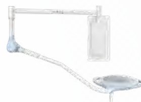
PENTA12PA | PENTA28PA