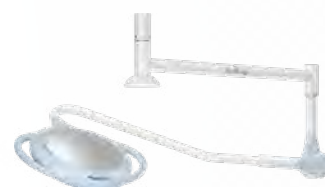
PENTA12SO | PENTA28SO