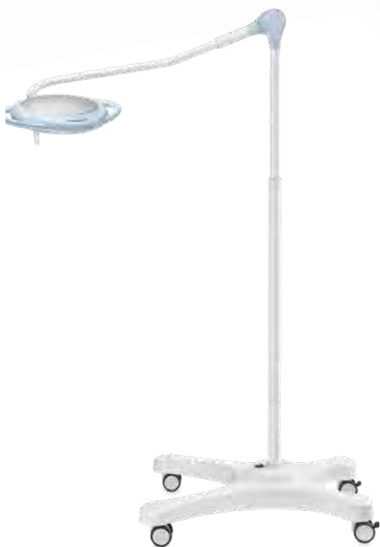
PENTA12PI | PENTA28PI