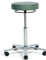
WORK STOOL 54 - 73 cm. Item code 3008305 5-star base polished, sitting cushion Ø 36 cm, cover in compact „Petrol“ C435, 360° manual ring release, safety castors.

Let us offer you some inspiration: Here is a small selection from the GREINER work stools and chairs' product range. Stools without backrest, chairs with backrest in different designs. Height adjustment by hand or foot. Base parts and sitting heights of your choice. Upholstery materials in a wide variety of colours with compact or premium fabric. Or EL 11 equipment that is suitable for surgeries with electrically conductive components. The choice is yours.