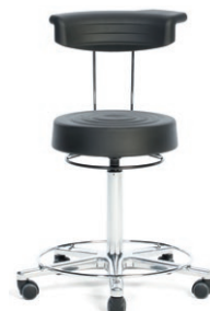
WORK CHAIR 54 - 73 cm. Item code 4019105 Chromed foot ring, full foam sitting cushion and crescent-shaped backrest, „Black“, 360° manual ring release, safety castors.