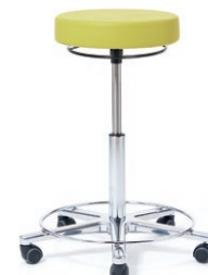
WORK STOOL 54 - 73 cm. Item code 3009105 Chromed foot ring, sitting cushion Ø 36 cm, cover in compact „Citron“ C500, 360° manual ring release, safety castors.