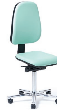
OFFICE CHAIR 54 - 73 cm. Item code 3054600 5-star base polished, backrest adjustable in height and depth with dumping function, without armrest, cover in compact „Mint“ C450, safety castors.