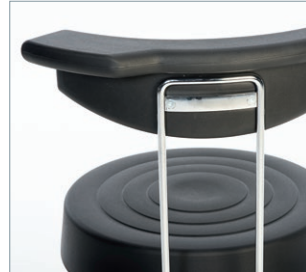
Modern design with high functionality