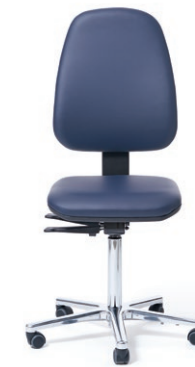
OFFICE CHAIR 54 - 73 cm. Item code 3054600 PREMIUM BS 5-star base polished, backrest adjustable in height and depth with dumping function, without armrest, cover in premium „Navy“ P710, safety castors.