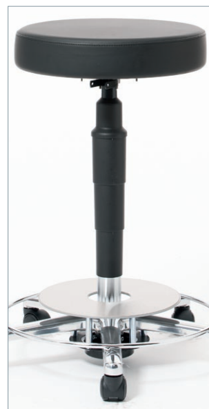
Surgery-compliant equipment EL 11 with electrical conductivity