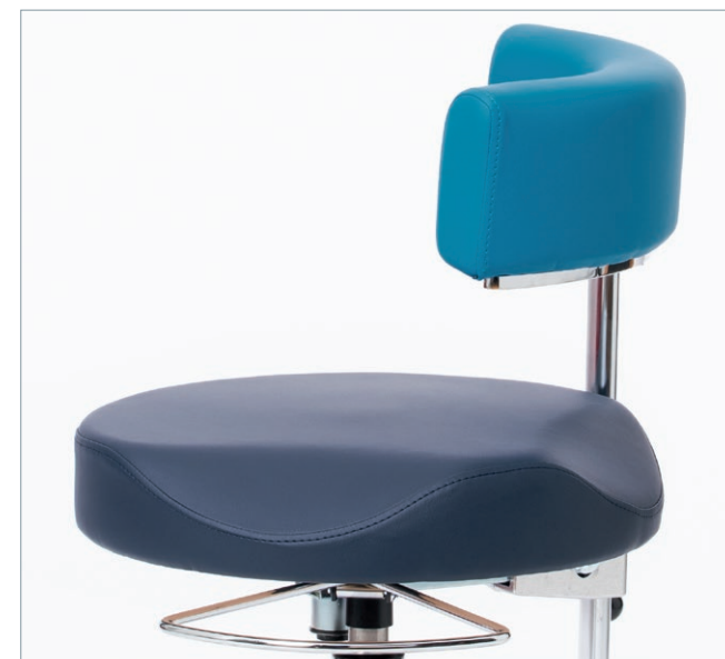
Fatigue-free operation thanks to support for arms or torso