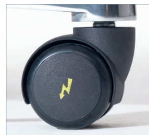
Electrically conductive safety castors, EL 11