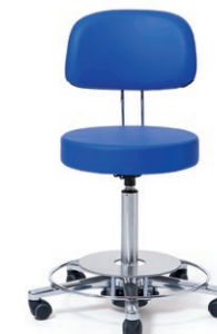
WORK CHAIR 51 - 71 cm. Item code 4155305 Foot release, backrest height adjustable, sitting cushion Ø 40 cm, cover in compact „Atoll“ C706, safety castors.