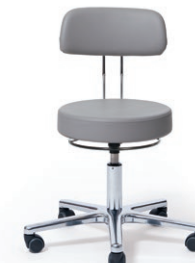
WORK CHAIR 40 - 52 cm. Item code 3018105 5-star base polished, small backrest height adjustable, sitting cushion Ø 36 cm, cover in compact „Stone“ C214, 360° manual ring release, safety castors.