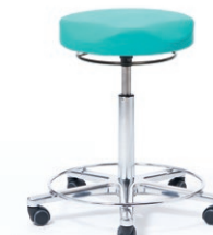
WORK STOOL 54 - 73 cm. Item code 4109105 Chromed foot ring, anatomically shaped seat edge Ø 40 cm, cover in compact „Cyan“ C422, 360° manual ring release, safety castors.