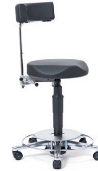
WORK CHAIR 51 - 71 cm. Item code 4185305 EL 11 Foot release, swivelling crescent-shaped backrest height adjustable, anatomically shaped seat edge Ø 40 cm, cover „Black“ EL 11, gas spring column and safety castors overall electrically conductive.