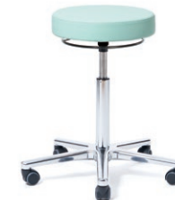
WORK STOOL 54 - 73 cm. Item code 3008305 5-star base polished, sitting cushion Ø 36 cm, cover in compact „Mint“ C450, 360° manual ring release, safety castors.