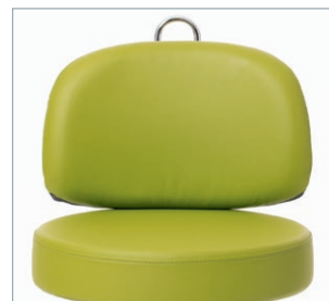
Large backrest front face