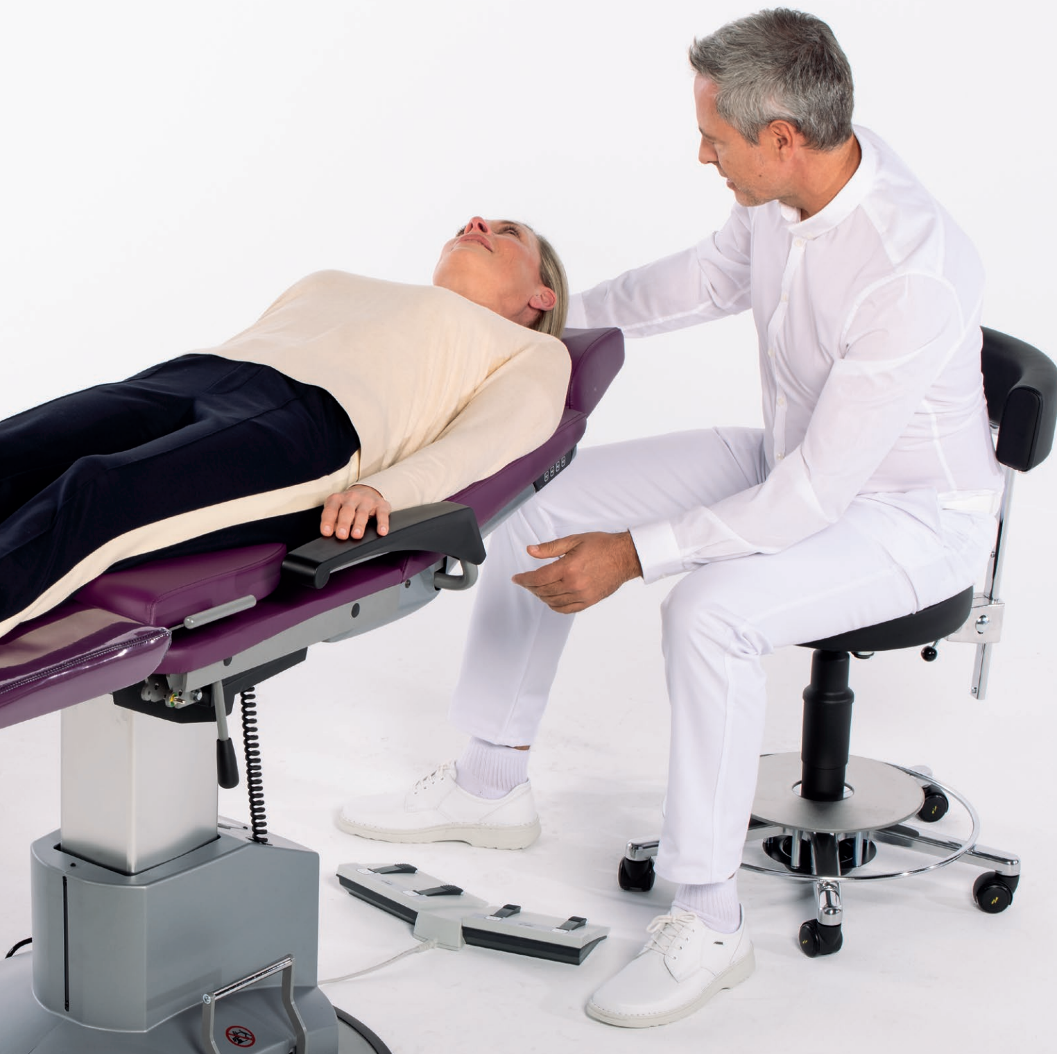
The examples shown here represent just a small selection out of the broad variety.

Let us offer you some inspiration: Here is a small selection from the GREINER work stools and chairs' product range. Stools without backrest, chairs with backrest in different designs. Height adjustment by hand or foot. Base parts and sitting heights of your choice. Upholstery materials in a wide variety of colours with compact or premium fabric. Or EL 11 equipment that is suitable for surgeries with electrically conductive components. The choice is yours.