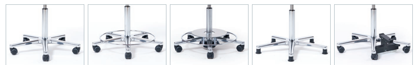
Manual ring release, 5-star base Manual ring release, foot ring Foot release with foot ring 5-star base with sliders Central arrest

This is what free choice looks like: The base parts of the GREINER work stools and chairs are characterised by their glossy design, quality and seating comfort. Otherwise, they are rather versatile and tailored to your needs. The foot release developed by GREINER, for example, offers high clinical added value wherever sterile or contaminated gloves are used. Triggered by the round pedal plate attached above the 5-star base, it can be operated "hands-free" all around. All work stools have safety castors, on request as an electrically conductive version.