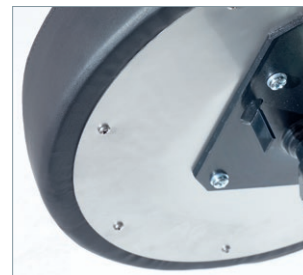
Stainless steel round plate