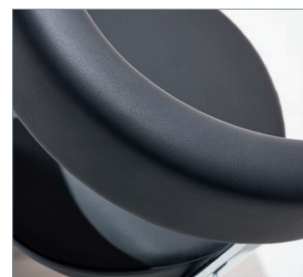
"Black" conductive cover, EL 11