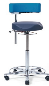
WORK CHAIR 54 - 73 cm. Item code 4185105 PREMIUM AS Chromed foot ring, swivelling crescent-shaped backrest height adjustable, anatomically shaped seat edge Ø 40 cm, cover in premium „Navy“ + „Aqua“ P710/700, manual height adjustment, safety castors.