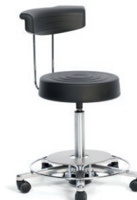
WORK CHAIR 51 - 71 cm. Item code 4015305 Foot release, full foam sitting cushion and crescent-shaped backrest, „Black“, safety castors.