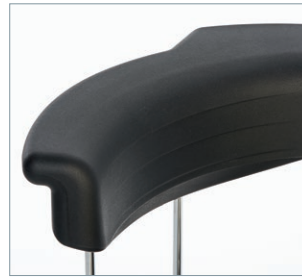
Crescent-shaped full foam backrest