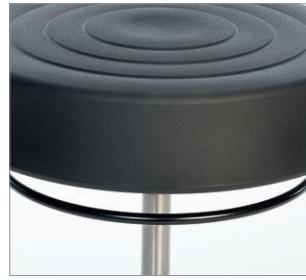
NexGen design and manual ring release