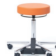
WORK STOOL 46 - 58 cm. Item code 3008205 CENTRAL 5-star base polished with central arrest, sitting cushion Ø 36 cm, cover in compact „Orange“ C530, 360° manual ring release.