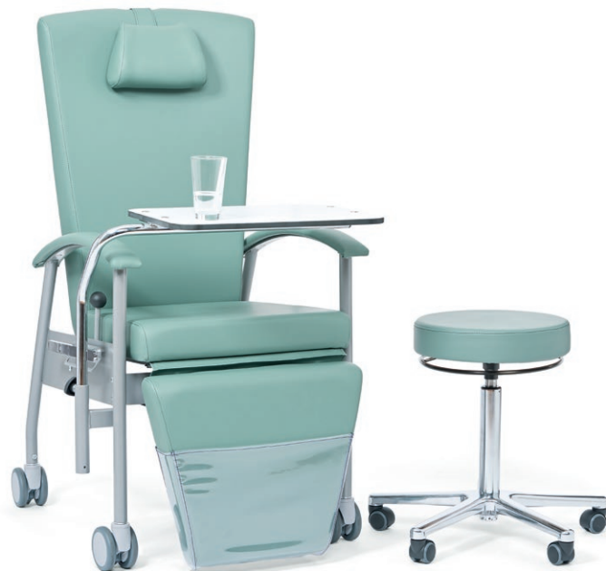
Versatile work stool that suits every treatment chair

Sit like a pro so you can work like a pro. Anatomy, ergonomics and functionality characterise the product design of GREINER's work stools and chairs. Modern sitting comfort not only stands for comfortable upholstery and backrests or smooth-running castors – every functional detail also contributes to an active and ergonomic sitting position.