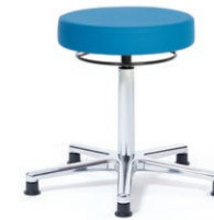
WORK STOOL 54 - 73 cm. Item code 4108305 RG 01 PREMIUM HO 5-star base polished with sliders, sitting cushion Ø 40 cm, cover in premium „Aqua“ P700, 360° manual ring release.