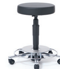
WORK STOOL 51 - 71 cm. Item code 4105305 EL 11 Foot release, sitting cushion Ø 40 cm, cover „Black“ EL 11, gas spring column and safety castors overall electrically conductive.