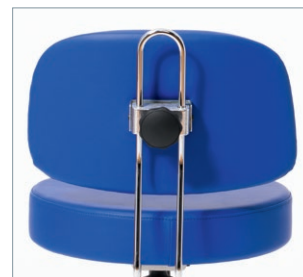
Large backrest from the rear