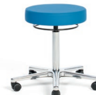
WORK STOOL 40 - 52 cm. Item code 4108105 PREMIUM HO 5-star base polished, sitting cushion Ø 40 cm, cover in premium „Aqua“ P700, 360° manual ring release, safety castors.