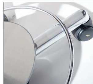
Foot release with foot ring