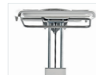
Height adjustment with dual control

The epitome of functionality, ergonomics, stability and hygiene, the new overchair tables have been meticulously designed to ensure they meet the most stringent requirements of patients and nurses alike. The sturdy frame in typical GREINER quality is combined with smooth-running castors to ensure the table is easy to move while still safely holding loads of up to 30 kilos. Powerful pneumatic springs make it easy to gently adjust the height of the tray with one hand – and provides added safety if the patient is in the emergency Trendelenburg position. On the BT plus the tray can be tilted at the touch of a button so that it is ergonomically positioned for both patient and nurse. The removable trays have recessed grips and are the perfect size for holding meal trays, patient items, clinical accessories and disinfectants. The tough, resistant surfaces are quick and easy to clean and disinfect. A range of accessories are also available to improve the patient experience still further.