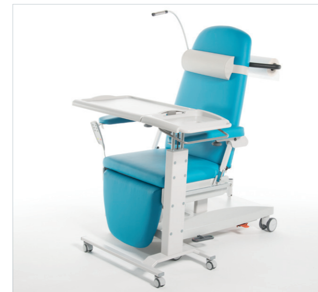
Perfect for combining with the MULTILINE NEXT DC and IT (IT shown here)

The epitome of functionality, ergonomics, stability and hygiene, the new overchair tables have been meticulously designed to ensure they meet the most stringent requirements of patients and nurses alike. The sturdy frame in typical GREINER quality is combined with smooth-running castors to ensure the table is easy to move while still safely holding loads of up to 30 kilos. Powerful pneumatic springs make it easy to gently adjust the height of the tray with one hand – and provides added safety if the patient is in the emergency Trendelenburg position. On the BT plus the tray can be tilted at the touch of a button so that it is ergonomically positioned for both patient and nurse. The removable trays have recessed grips and are the perfect size for holding meal trays, patient items, clinical accessories and disinfectants. The tough, resistant surfaces are quick and easy to clean and disinfect. A range of accessories are also available to improve the patient experience still further.