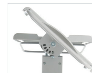
Swivelling tray (BT plus)