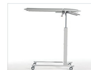
Design and quality made by GREINER