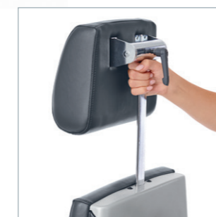
Ergo headrest as standard can be easily exchanged