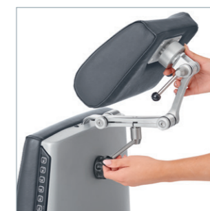
Quick and easy positioning – unique joint fixture