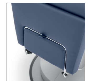
Foldable footrest, optically perfectly integrated into the leg section