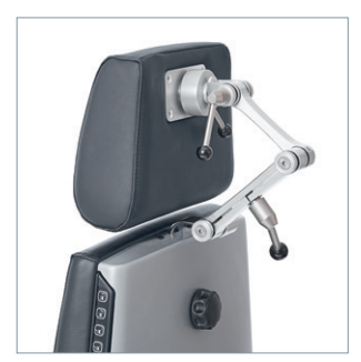
Ergo headrest with Vario double joint and Quick Assist quick coupling