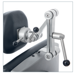
Use of the Vario double joint