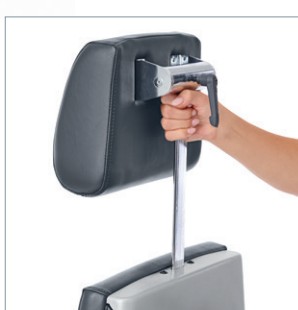
Ergo headrest as standard can be easily exchanged