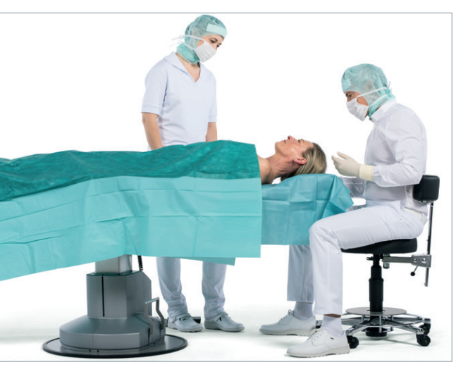
eatment and surgery when reclined, sitting in the 12 o'clock position