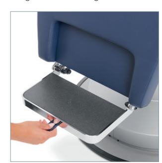
With synchronous adjustment, the step plate moves ergonomically