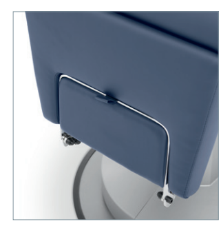
Foldable footrest, optically perfectly integrated into the leg section