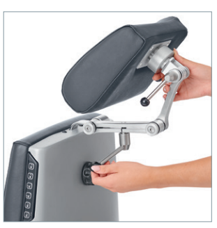
Quick and easy positioning – unique joint fixture