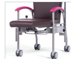
Robust base with smooth-running castors