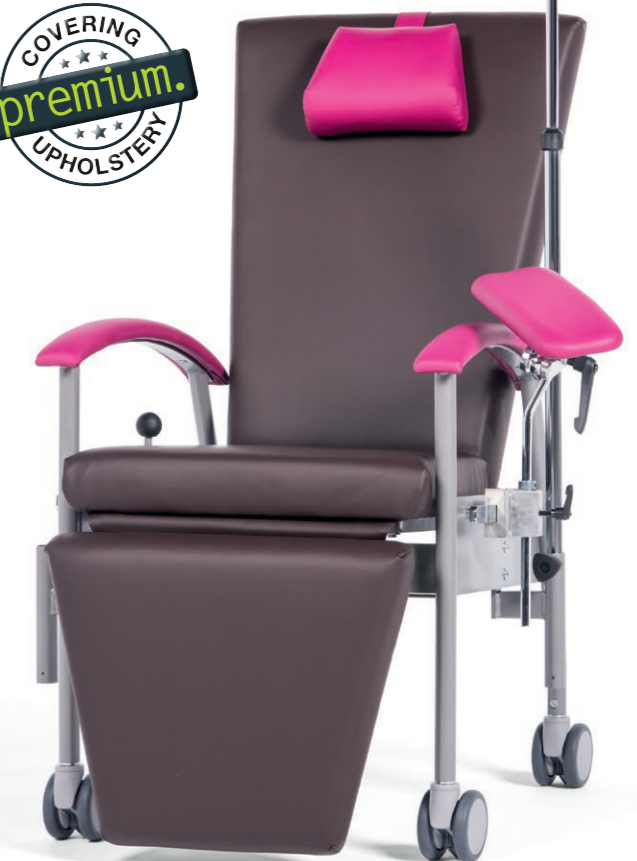
SITA in premium material chocolate/fuchsia with blood collection armrest on the standard rail and infusion rod in holder