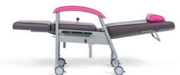
Bed position/Flat position