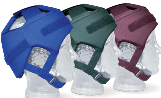
Colour variants for Starlight® Base