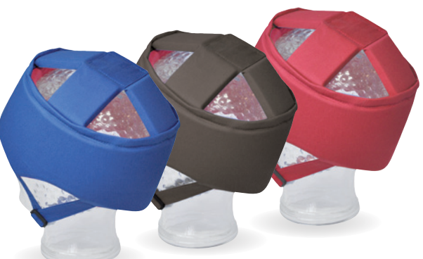
Starlight Standard colour brown, red and blue